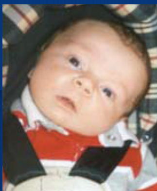
Infant Before Treatment