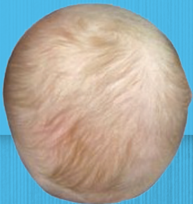
After STARband® Treatment