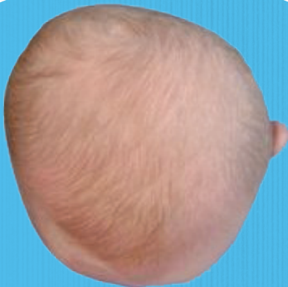
Before STARband® Treatment