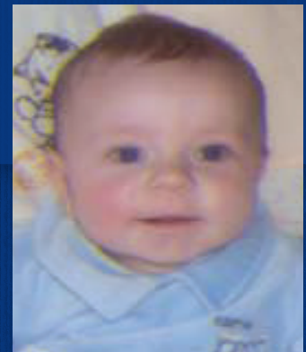
Infant After 4 Months