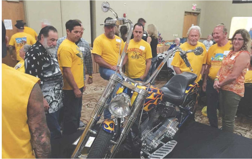
Arlen Ness, third from right, and others gather around a custom motorcycle he created. The bike was auctioned off at Monday's Hamsters USA banquet at the Spearfish Holiday Inn.