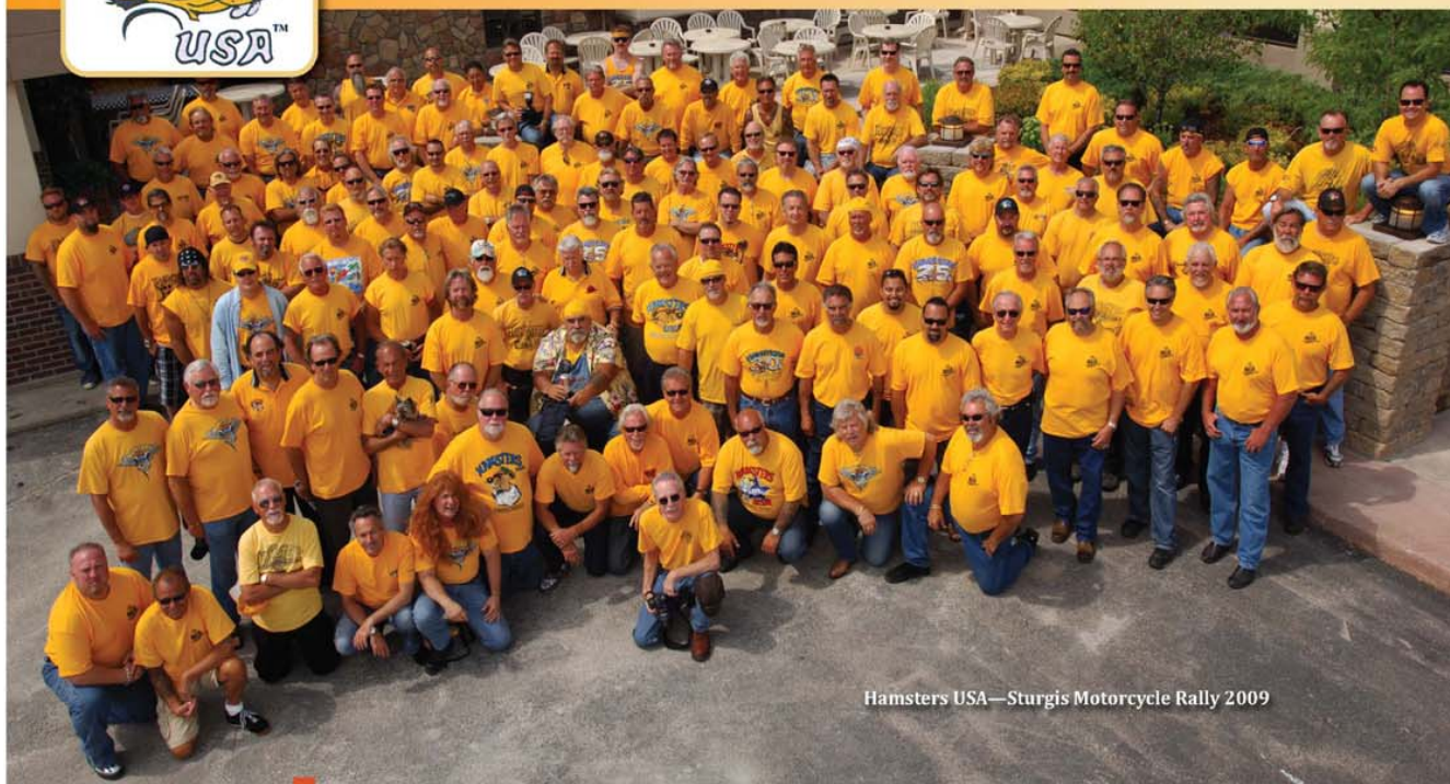
Hamsters USA—Sturgis Motorcycle Rally 2009

If the heart of custom motorcycling can be understood or experienced anywhere, it is most likely within the Hamsters USA organization. This is a group that is bound together by the love of custom bikes and the desire to spend quality time and develop lifelong friendships with like-minded people. These are men that work hard and play well. They are clearly the most distinguished group of custom motorcycle enthusiasts in the world.