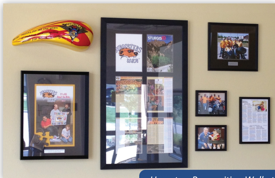
Hamsters Recognition Wall at LifeScape Children's Care Services in Rapid City

Hamsters USA has raised and donated funds at their annual meeting for the last ten years, wanting to give back to the greater Black Hills community, where they love to attend the annual Sturgis Rally. Their commitment to children with special needs has ensured that thousands of children over the years have received vital services. We thank Hamsters USA for making life better for kids in Western South Dakota!