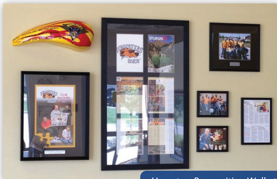
Hamsters Recognition Wall at LifeScape Children's Care Services in Rapid City

Hamsters USA has raised and donated funds at their annual meeting for the last ten years, wanting to give back to the greater Black Hills community, where they love to attend the annual Sturgis Rally. Their commitment to children with special needs has ensured that thousands of children over the years have received vital services. We thank Hamsters USA for making life better for kids in Western South Dakota!