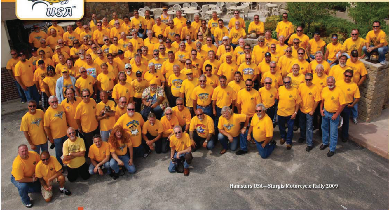
Hamsters USA—Sturgis Motorcycle Rally 2009

If the heart of custom motorcycling can be understood or experienced anywhere, it is most likely within the Hamsters USA organization. This is a group that is bound together by the love of custom bikes and the desire to spend quality time and develop lifelong friendships with like-minded people. These are men that work hard and play well. They are clearly the most distinguished group of custom motorcycle enthusiasts in the world.