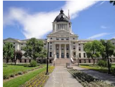
Department of Human Services (DHS)