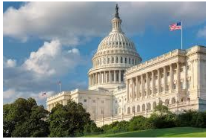
Center for Medicaid & Medicare Services (CMS)

1999 Olmstead Supreme Court decision drove ADA/Medicaid programs placing the burden on the state to provide community-based services to those with developmental disabilities including improved access, availability, quality, and choice through various waivers including CHOICES. Failure to provide adequate / reasonable services is considered discrimination. Federal (56%) FMAP funds match (44%) state funds to provide mandated services.